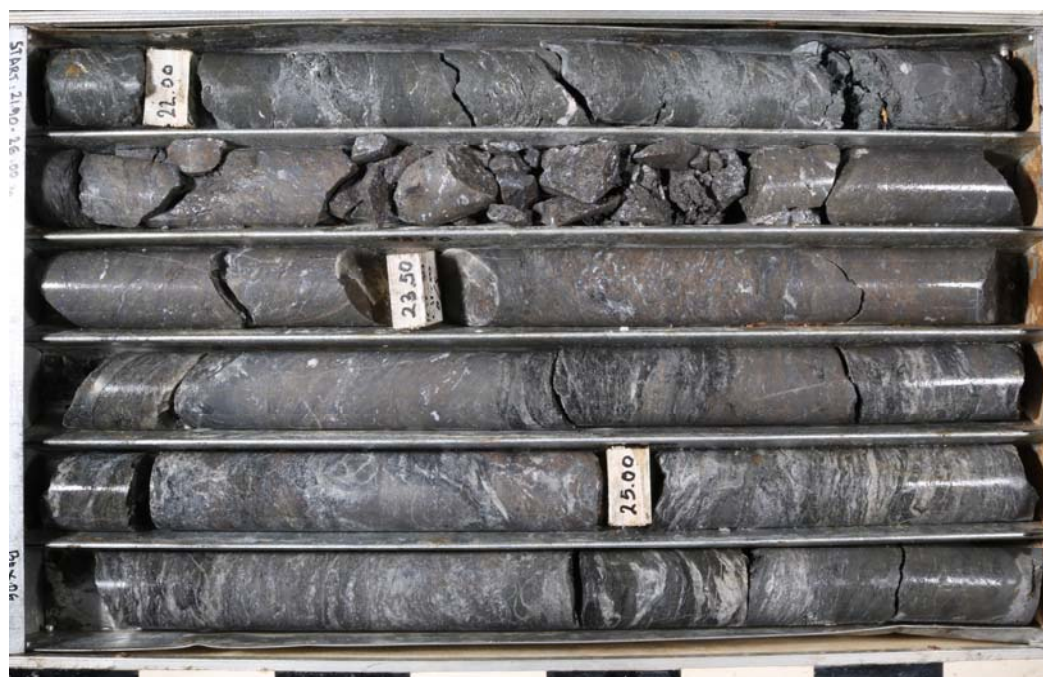
Figure 2: Semi-massive Sphalerite (Zn sulphide) and Galena (Pb sulphide) mineralisation in BKZ33750-03. The weighted average grade for the interval 22.5m – 25.5m (3m interval) is 14.3% Zn, 8.1% Pb and 2101g/t Ag